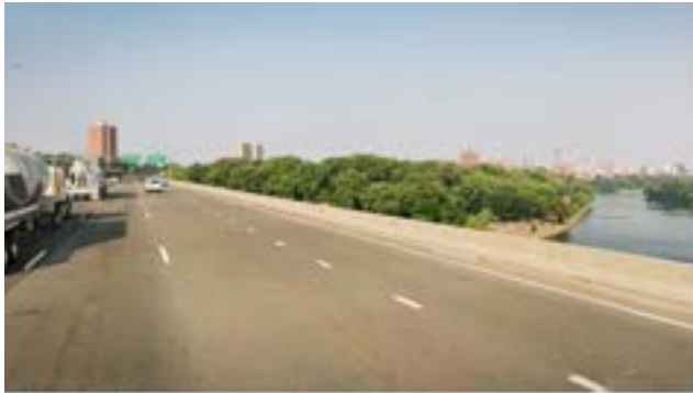
Over a 100 bridge today that are not accessible pedestrian or cyclist. Despite a variety of ways and responses to the actual network.