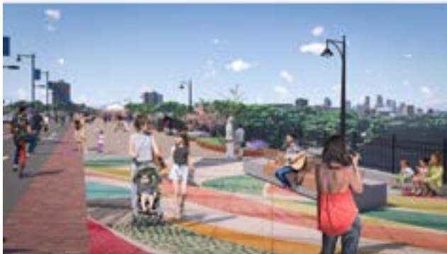
Reimagining that a 100th Anniversary from bridge would mean a vibrant walk gathering space in the new design.